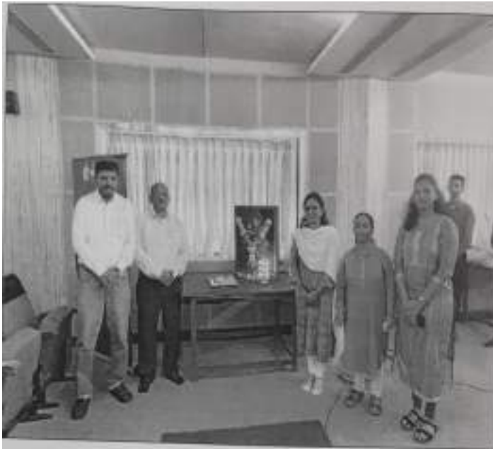
Inauguration of the event