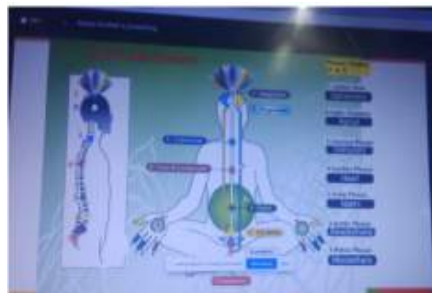
Chakra system in our body